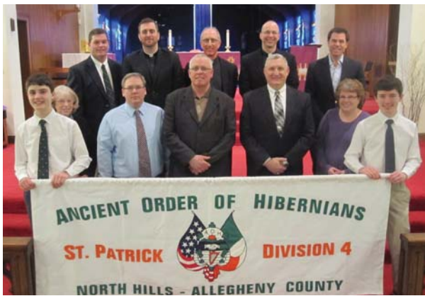
On March 13, 2015, Angel Funds checks were presented to 12 elementary schools located on the North Side/North Hills at St. Alphonsus Church in Wexford.

Few things are as precious to parents as a solid educational foundation based on firm religious principles for their children. But many families struggle to make this happen. The Ancient Order of Hibernians, Division 4, North Hills is dedicated to help these families through our Tuition Assistance Fund.